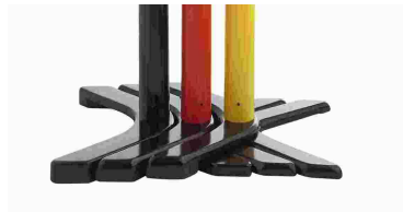
Fig. 2: Easy and space saving storage