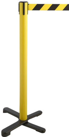
Fig. 1: GLA 10-E/17

Professional queue management – easy space saving storage.