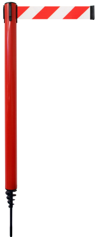
Pict. 1: GLA 24-D/13-4,0