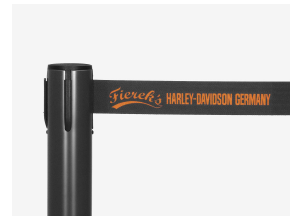
Abb. 2: GLA 28-A with digitally printed tape