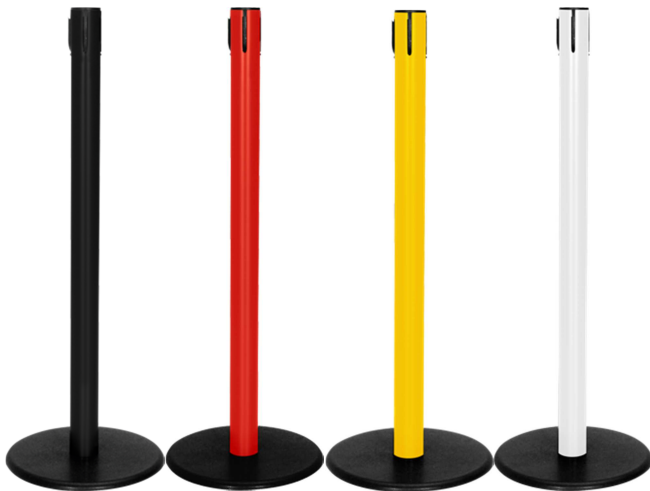
Pict. 1: GLA 28 in different standard colours