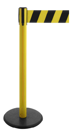
Pict. 1: GLA 29-A