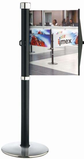
Pict. 1: GLA 30-A