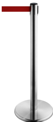
Pict. 1: GLA 45-S - stainless steel finish