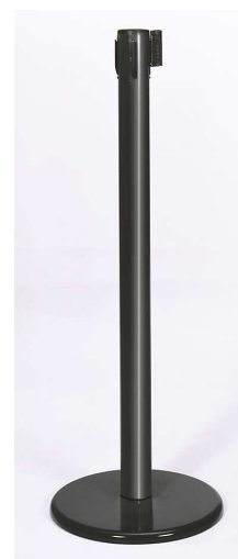
Pict. 3: GLA 45-A - grey coloured