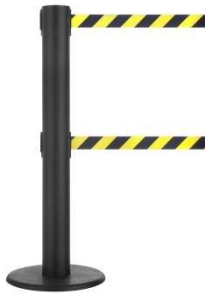
Pict. 1: GLA 89-J/17-9.0