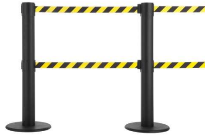
Pict. 2: barrier row of 2x GLA 89-J/17-9.0