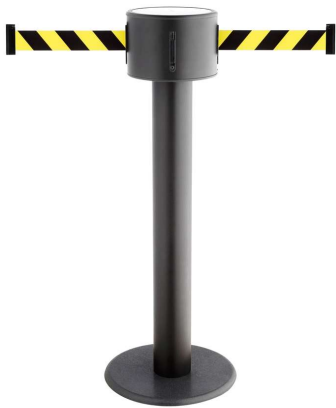
Pict. 1: GLAD 85-J/17