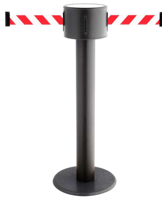
Pict. 2: GLAD 85-J/13