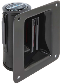
Pict. 1: GLW 15-J