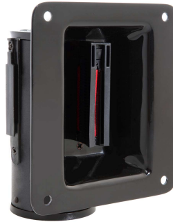
Pict. 2: GLW 15-J