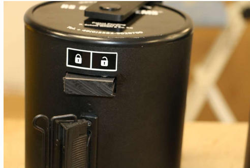
Pict. 2: arrester device