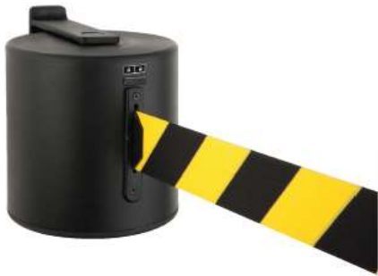
Pict. 1: GLW 2000-17