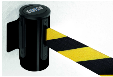
Pict. 2: GLW 25-J