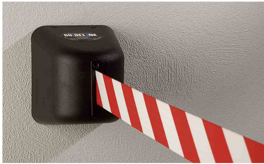
Pict. 1: GLW 480-J/13-8.0