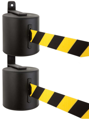
Pict. 1: GLWD 2000-17