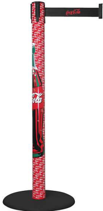
Fig. 1: GLA 15

Professional queue management – with your advertising.