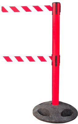
Pict. 1: GLA 250-D/13-4,0