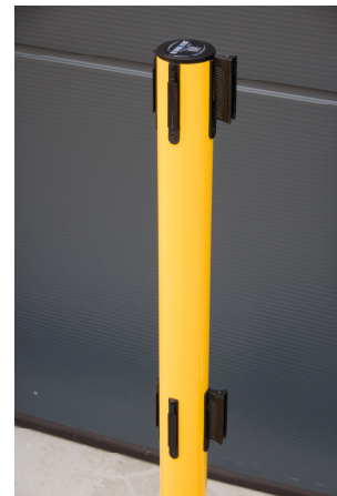
Pict. 3: GLA 250-E/17-4,0

Base weight made of recycled compound material Post tube can be recycled at 100 %