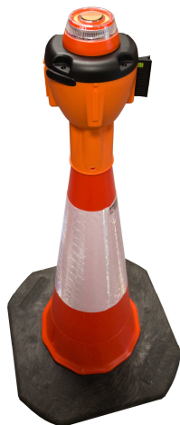
Pict. 1: ALCT-FL = light on cone topper ALCT-O (cone and cone-topper not included)