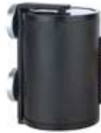
Pict. 2: Magnetic Fixation