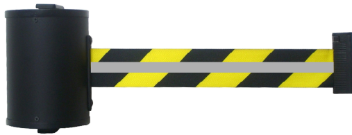
Pict. 1: GLW 700-J/17R

Flexible in direction and tape extension.