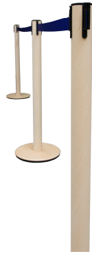
Abb. 2 GL ECO 28 with blue belt