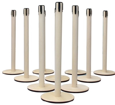
Abb. 1 GL ECO 28