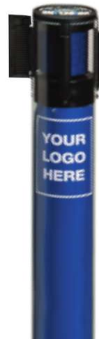
Pict 2.: GLA 28-C - sample