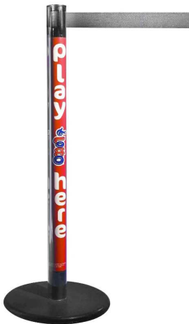
Pict 1.: GLA 28-C - sample