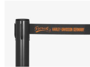
Pict. 2: GLA 28-A with printed tape